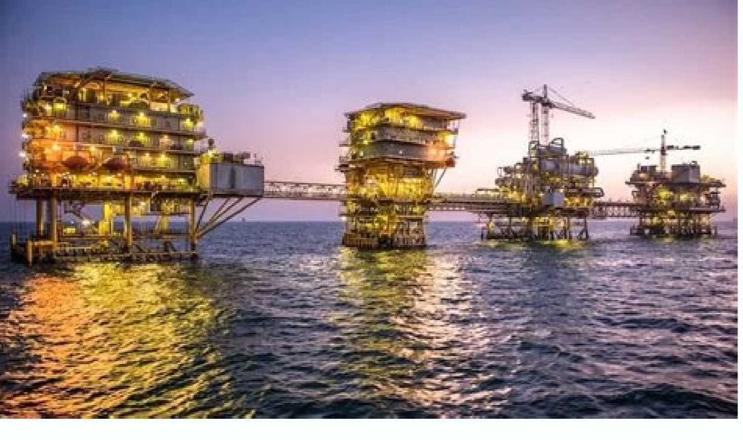
2019 operational calendar saudi aramco. Saudi aramco operational calendar 2019 pdf.